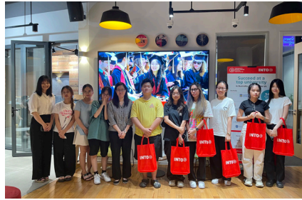
University of East Anglia (UK) Pre-departure briefing