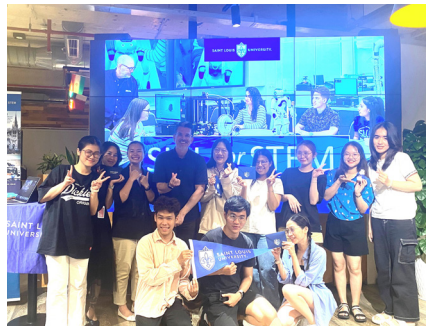
Saint Louis University (US) Student-Facing Event