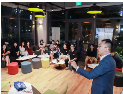
University of Western Australia (AUS) Student-Facing Event