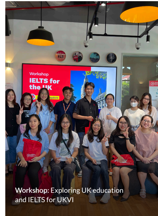
Workshop: Exploring UK education and IELTS for UKVI