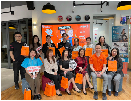
Oregon State University (US) Group Agent Training