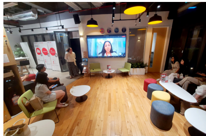
City, University of London (UK) Parent-student meeting