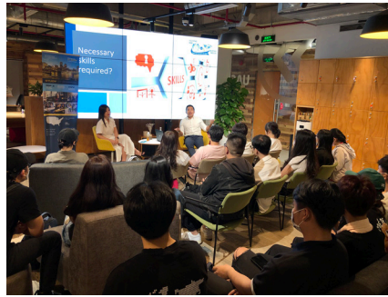
Suffolk University (US) Workshop Session