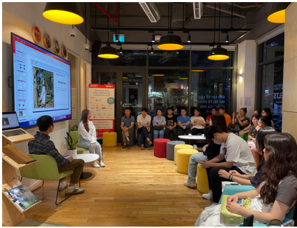
In Collaboration With a Local Agent Pre-Departure Briefing