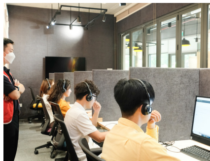
British Council Computer-Delivered IELTS Testing