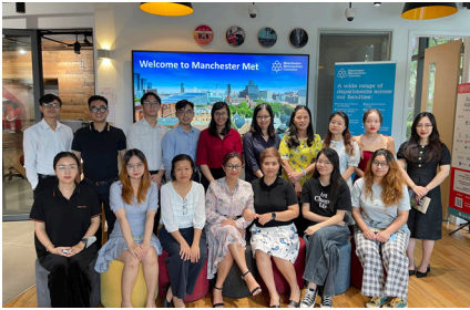
Manchester Metropolitan University (UK) Group agent training