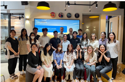
INTO London – World Education Centre (UK) Student-facing event